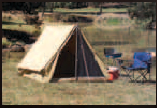
Hike Tent Sleeps: 1-2 people