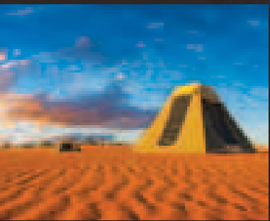
Ultimate 9 Sleeps: 2-4 people