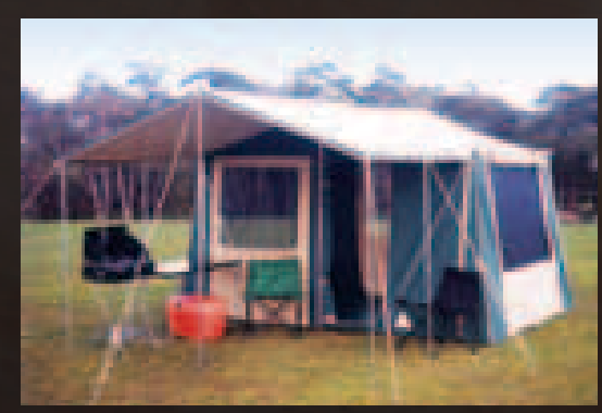
The Settler Sleeps: 4-6 people