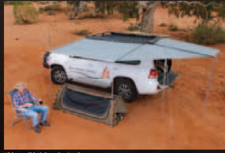
Ultimate Side & Rear Car Awning