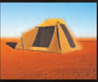
Ultimate Deluxe Sleeps: 2-5 people