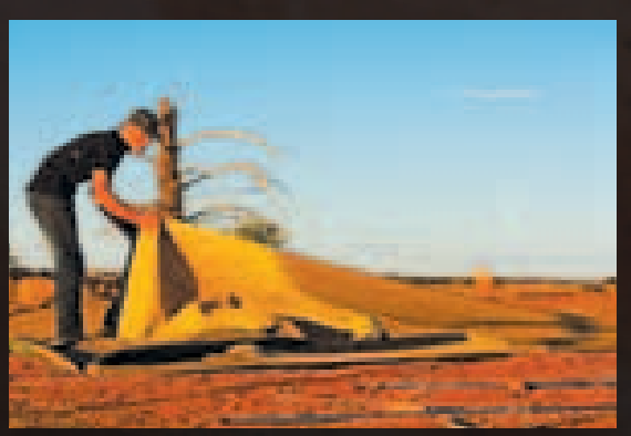
4. Once more repeat the process of rolling the frame on to itself to the left. By doing this, it then pulls the next two seams taught.