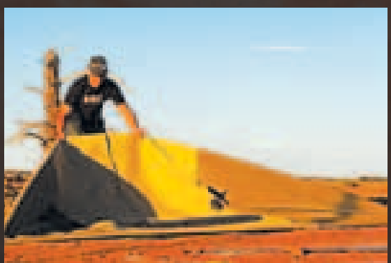
5. At this point pull the roof frame taught again. You should be back to where you started. With the canvas all nicely folded.