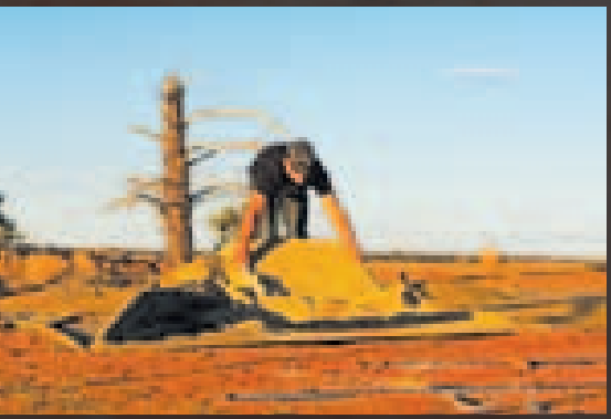
6. Place the roof frame flat on the ground. The trick is to place the frame the same width of the frame away from the external edge of the tent.