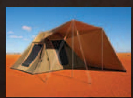
Small Awning with wind break wall