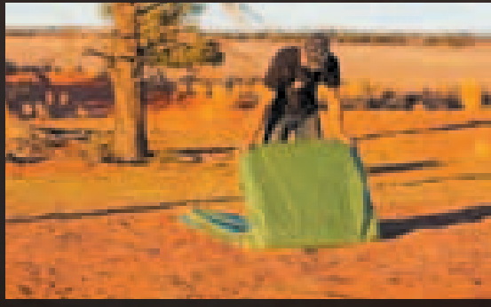
12. Now grab the roof frame where you have just created the last fold. Fold that backwards again using the roof frame this time. By doing this it ensure that the tent is been packed as taught as possible to the roof frame.