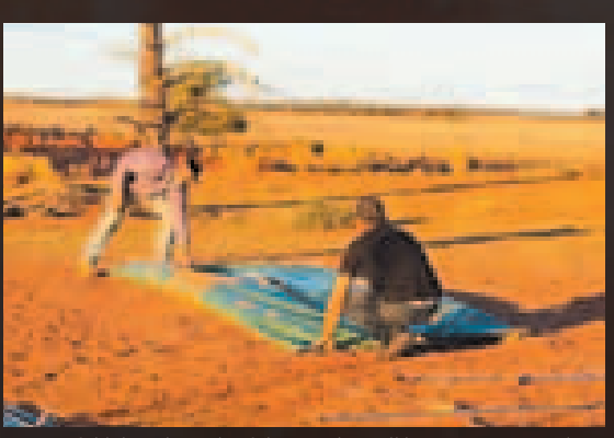
8. Now fold the other side of the tent that still has canvas exposed length ways, so that the outside edge of the tents now touches the other edge of the floor. Basically to the edge of the roof frame. You should now only have the underside of the tent (vinyl) showing. Folding the tent in this manner ensures that none of the flooring comes in contact with the canvas.