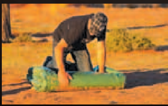
13. Follow the previous step again. You should now find that you have a perfectly packed tent that will pack away into its carry bag every time. After some practice you will find packing up your Southern Cross Tent can be packed up with ease.