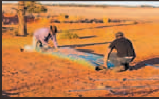
9/10. Fold the section that you have just folded over the top of the roof frame. You should now be left with a neatly folded length of tent that is the same width as the roof frame.