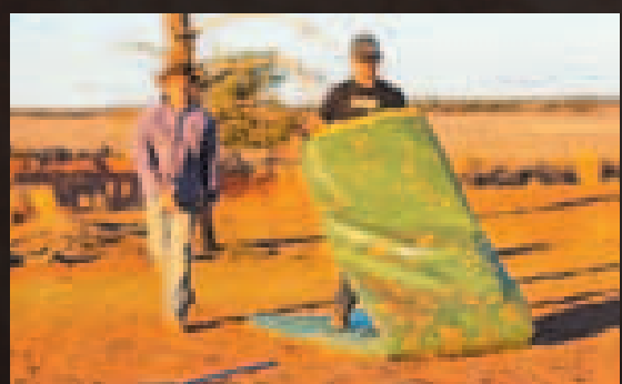
II. Once this has been done, you can now grab the edge of the tent and bring it backwards towards the other edge of the tent length ways, until you have reached the edge of the roof frame.