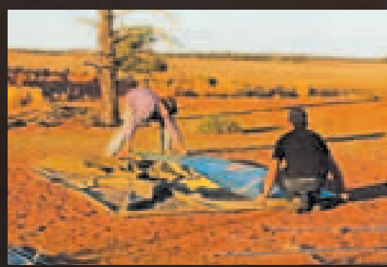
7. Now fold the whole length of the floor over the top of the roof frame, so that the edge of the canvas is now on the far edge of the roof frame. Basically you should have a fold that is the same width of the roof frame running length ways down the whole floor of the tent.