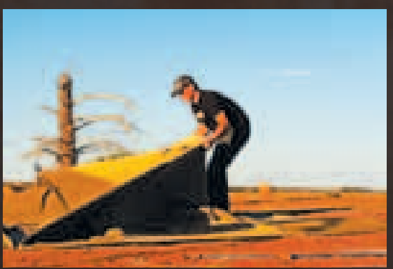
2. Roll the frame on to itself to the left. By doing this, it then pulls the next two seams taught, whilst naturally folding the canvas.