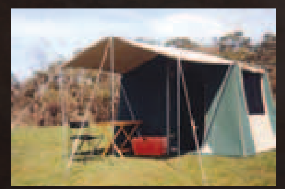
The Hut Sleeps: 3-4 people