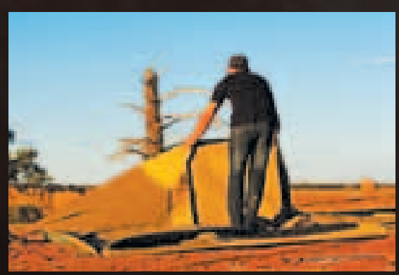
Again repeat the process of rolling the frame on to itself to the left.By doing this, it then pulls the next two seams taught.